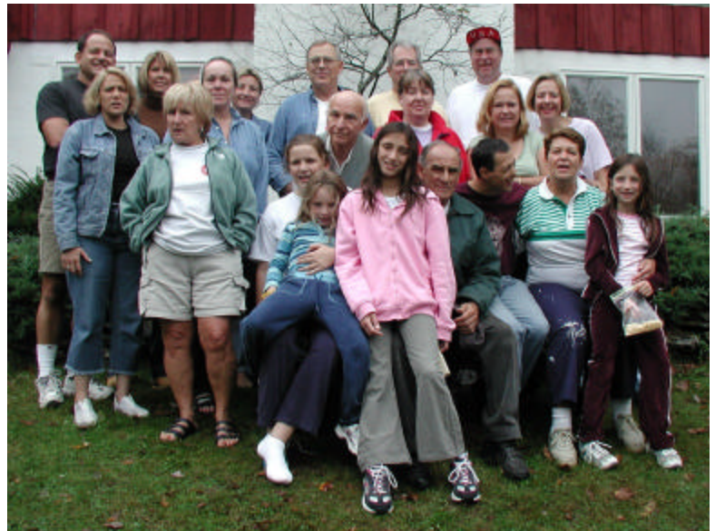
Here's the Gang