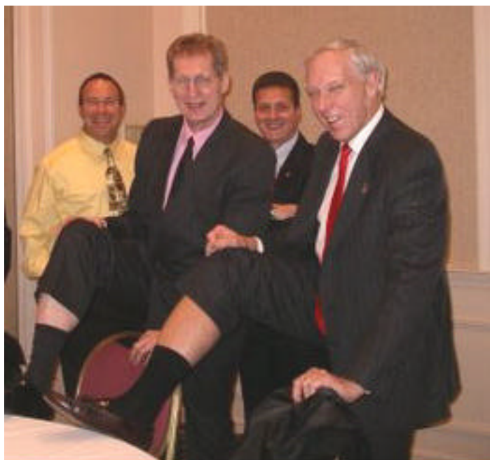
Look who else is showing some leg!