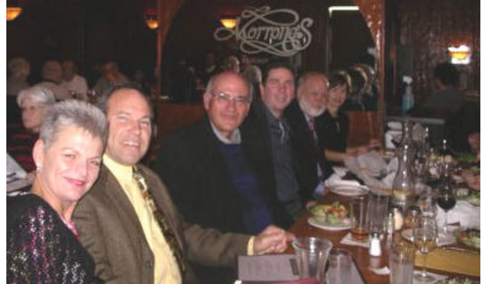
Dinner before the Snowball

Your participation is greatly appreciated, so if you would like to plan or contribute to an activity, please contact Chris Zimmerman at (203) 324-0003 or supe203@yahoo.com .