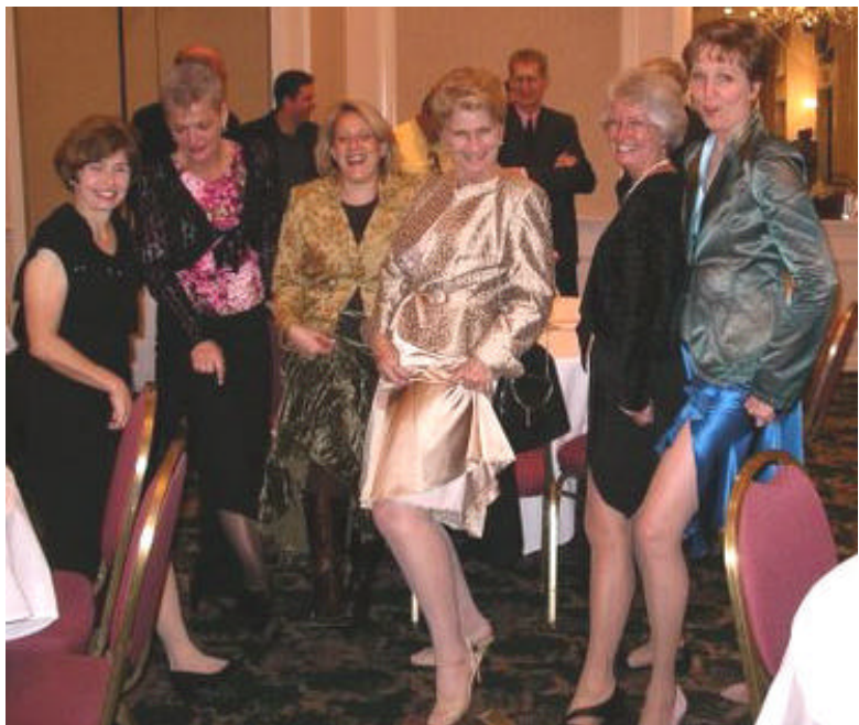
The ladies show a little leg!