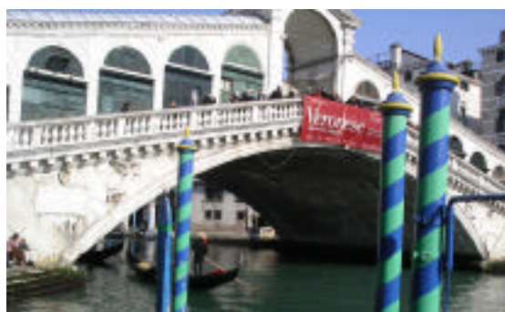
RHSC at the Rialto Bridge.

in caves carved out of the solid rock of the mountains.