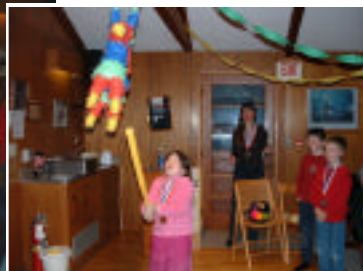
Guacamole and more at the lodge; the first RHSC Piñata.