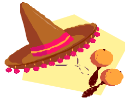
Mexican Fiesta including a kid's piñata