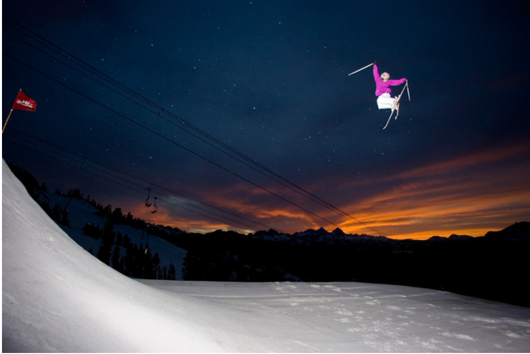
MoGo Spokesperson Kristi Leskinen

medalist. She is also the first female athlete to successfully complete a Rodeo 720.