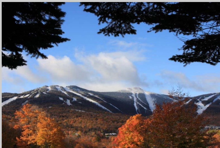
Killington - October 2010